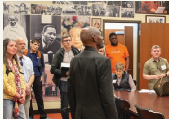
Pilgrims spending time at Morehouse College

—reflection from Paula, one of the pilgrims