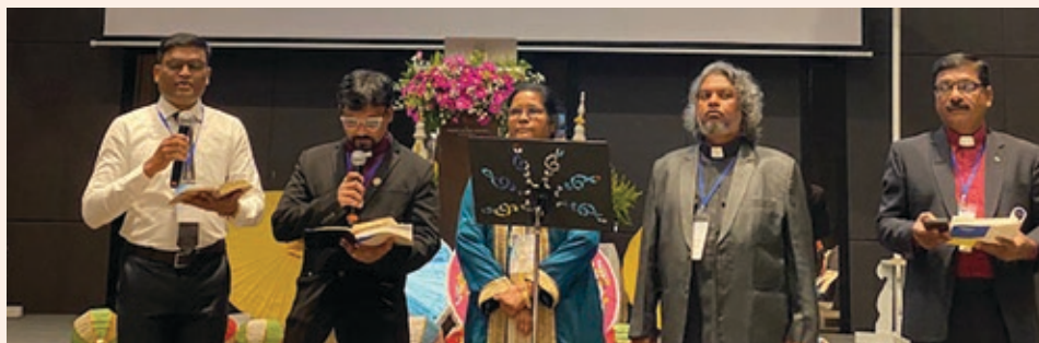
The Marathi publishing team