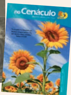
The original and current covers of the Portuguese-Brazil edition